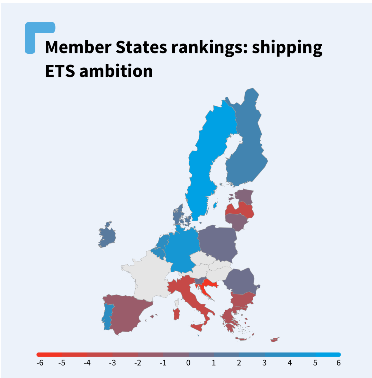
Note: Blue shows the ambitious Member States, red denotes the unambitious ones. Landlocked countries (Czechia, Slovakia, Hungary, Austria and Luxembourg) have been removed. France is also removed as it takes no official position as the President of the EU Council.